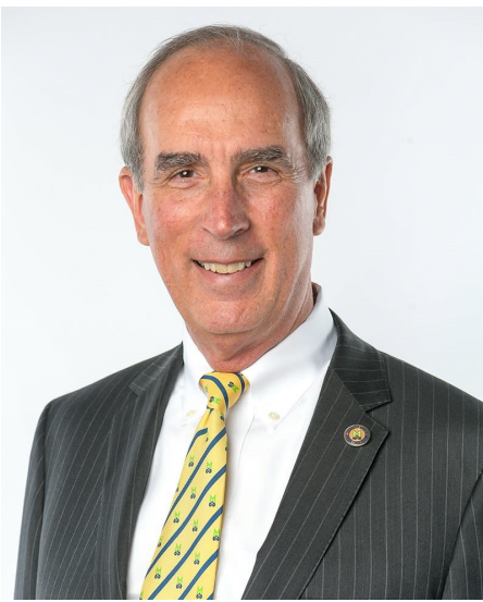
Mayor Sandy Stimpson