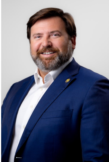
Spiro Cheriogotis Mayor of Mobile

Over the past decade, Mobile and Coastal Alabama have experienced unprecedented economic growth and generational investments in public infrastructure, amenities, and quality of life. Mayor Cheriogotis is focused on continuing that momentum while also ensuring that all Mobilians have an opportunity to share in their city's success.