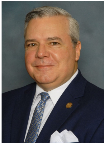
Representative Chip Brown Alabama House of Representatives House District 105