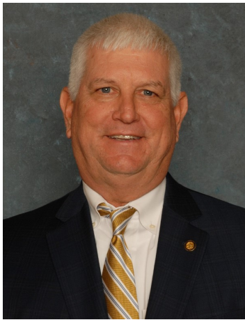
Senator David Sessions Alabama State Senate District 35